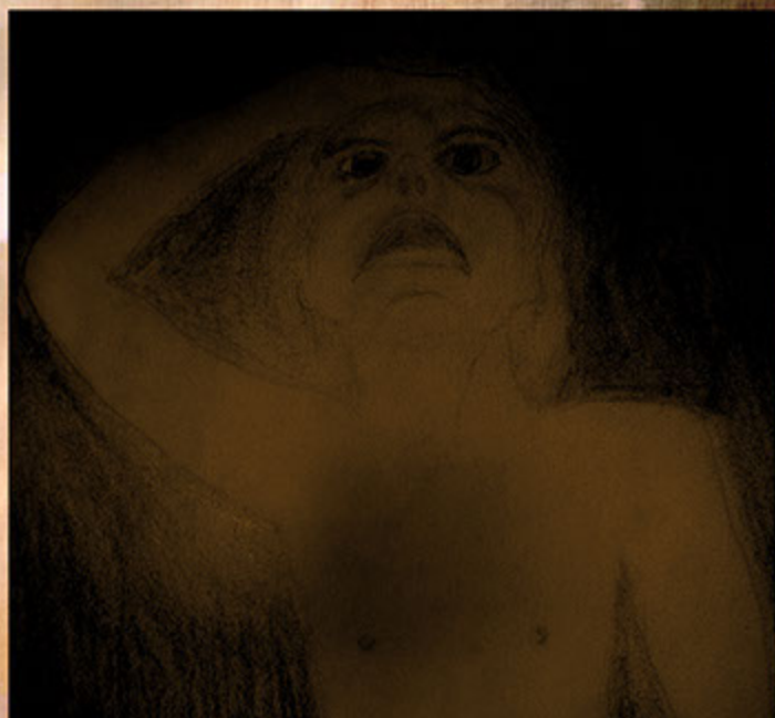
"Despair" © Carol Nigro

'DESPAIR' BY CAROL NIGRO FT LAUDERDALE, FLORIDA ONE OF A COLLECTION BY CAROL ENTITLED 'EMOTIONS OF A ROCK POET' carolnigro@yahoo.com